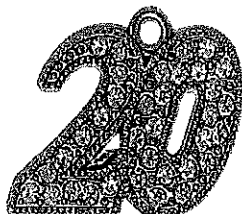
Bling w/ Tassel